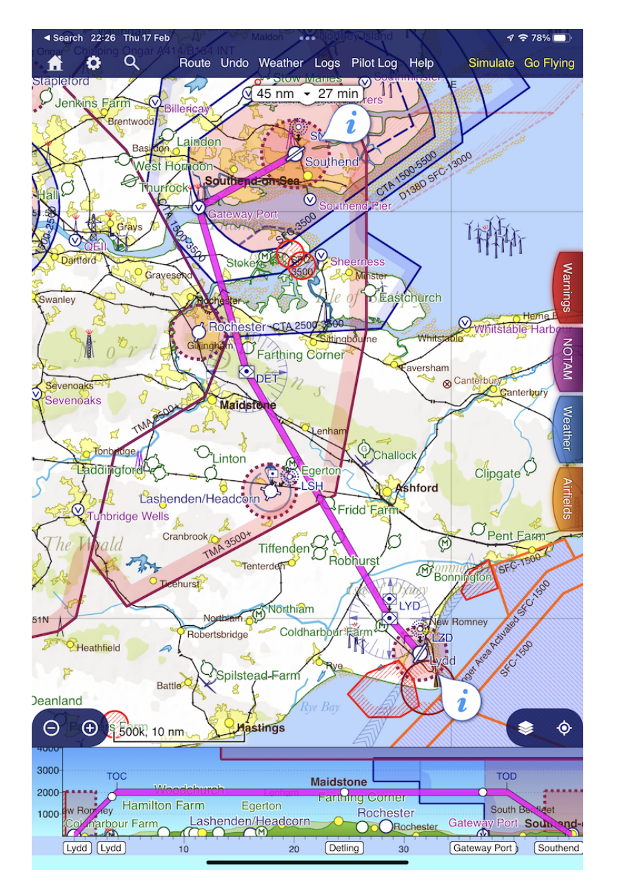
15:00 Land at Southend, debriefing, lunch, drive home.